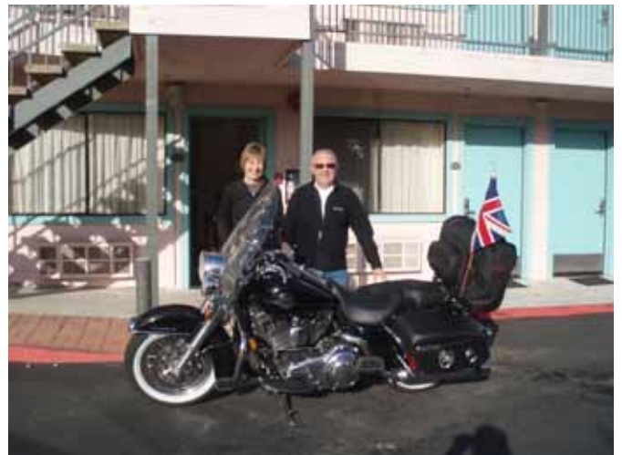
Splashed out at the Econolodge in San Louis Obispo - I know how to treat a lady!

ably cold (I can hear you all saying ahhhhh!), but by the time we got to LA the weather had totally flipped to a heatwave - just in time for the desert section!! Moral to the story is take plenty of clothing layers. I set off from San Fran' in two t-shirts, a hoodie, a fleece and a summer motorcycle jacket. By the time we got to Palm Desert(106 °F) I was down to a t-shirt (plus jeans of course).