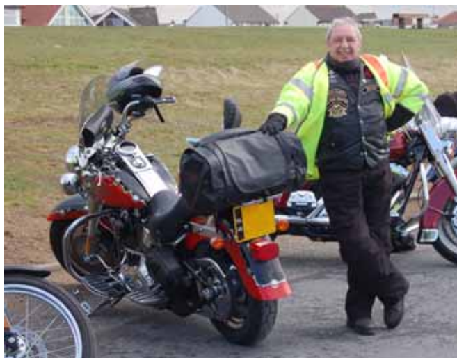
Enjoying the sea at Crosby at April's Rideout