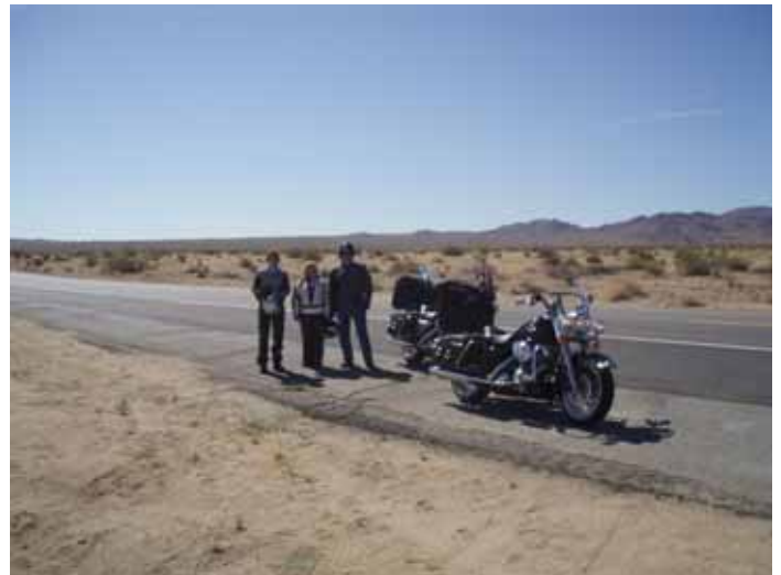
Mojave Desert near Barstow - hot,hot,hot, - what a contrast to a couple of days earlier

Riding up from Barstow we had an over night stop at the famous Dow Villa Hotel at Lone Pine. Lone pine is adjacent to the highest point in USA, Mount Whitney and the lowest point, Death Valley. We rode as far as you can go up Mount Whitney (around 9000 feet), what an amazing view.