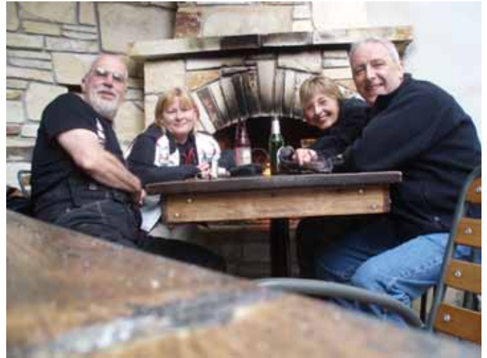
Having a cool one in Clint Eastwood's bar, the Hog's Breath Inn in Carmel - the beer is alcohol free in case you are wondering!

ably cold (I can hear you all saying ahhhhh!), but by the time we got to LA the weather had totally flipped to a heatwave - just in time for the desert section!! Moral to the story is take plenty of clothing layers. I set off from San Fran' in two t-shirts, a hoodie, a fleece and a summer motorcycle jacket. By the time we got to Palm Desert(106 °F) I was down to a t-shirt (plus jeans of course).