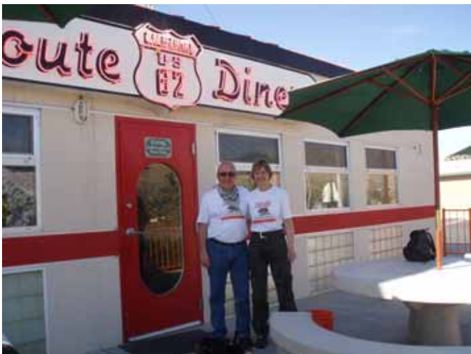
The Route 62 Diner is attached to the Yucca Valley Harley-Davidson dealership and opens from 7am to 2pm - brill place for breakfast

Heading inland the temperature is always higher, but, as I said earlier, we hit a heatwave at just the wrong time. The desert is an awesome place to ride - the vastness just takes your breath away, and so does the heat. This