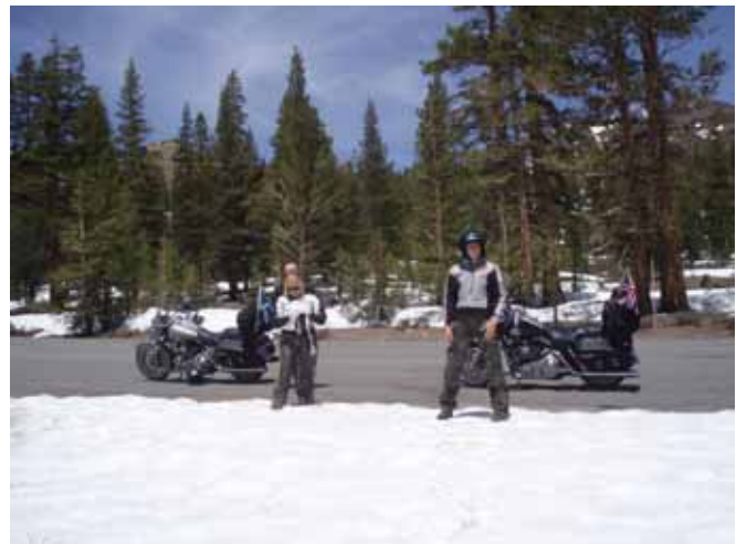
Two days after the desert picture at the top of the page, we are above the snowline in Yosemite National Park - surreal