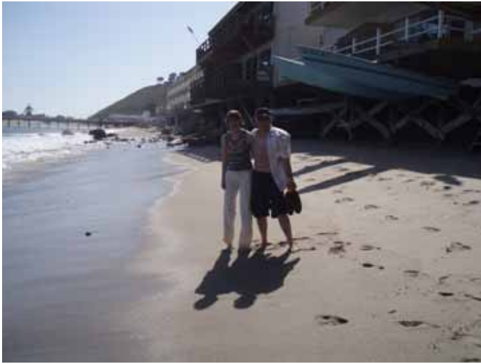
Made up for the Econolodge by booking into the Malibu Beach Inn - that's us with the hotel in the background - got my Brownie points back.

US1 goes through some dodgy areas in LA.