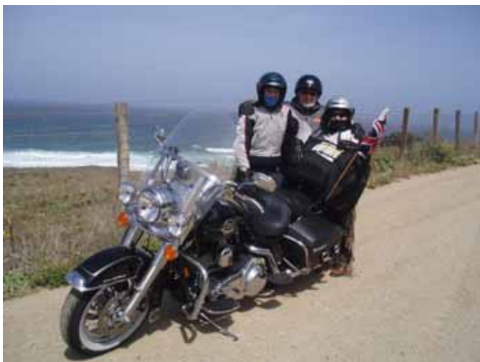
Wrapped up from the chilly weather next to the Pacific Ocean

When we set off the weather was unseason-